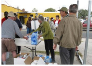
Feed My Lambs